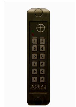
The ISONAS PowerNet Reader-controller with optional Keypad

Now the Crystal Matrix Software™ which comes bundled with your ISONAS IP Readers is available with the Advanced Security Option (ASO), designed to relieve Property Managers of the administrative and clerical burden of frequent updates to the database. Tenants can do it themselves!